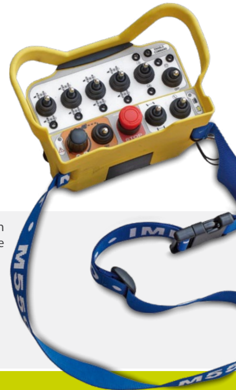
Multi-function remote control device